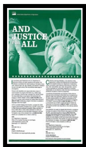
USDA (And Justice for All)