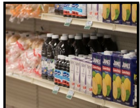
Example of USDA label on pantry shelf