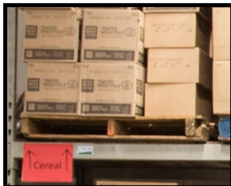
Example of USDA label in warehouse