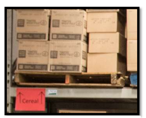
Example of USDA label in warehouse