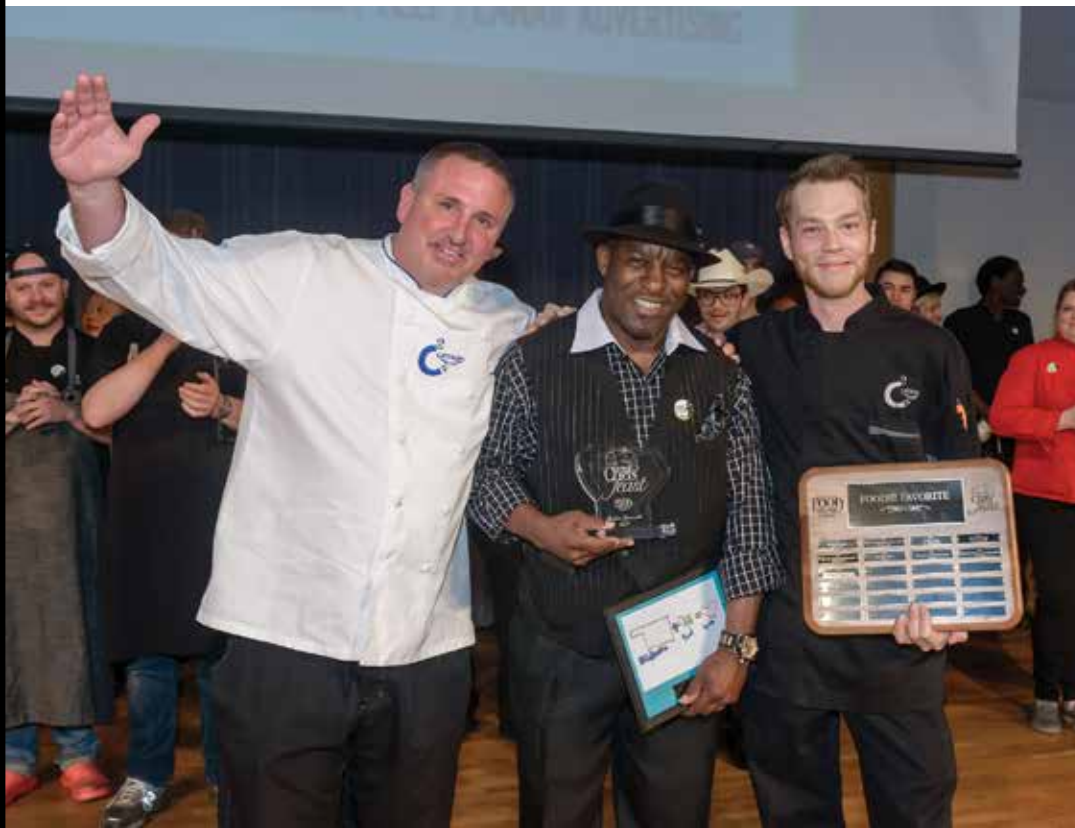
Last year's Foodie Favorite award winner, McNeal's Catering.

After you've enjoyed your favorite derby-inspired foods, vote for your favorite Chefs' Feast chef! Use the Foodie Favorite ballot on your table and drop it into the box, by 8 p.m., at the Food for Kids table, located outside the main doors. The winner will be announced at 8:45 p.m. during the Win, Place and Show.